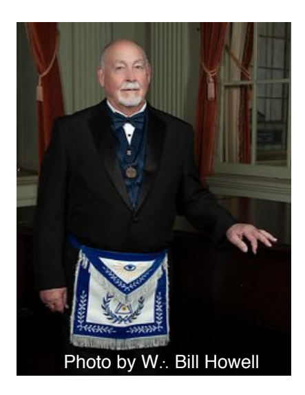
A Note of Thanks

In passing the resolution to increase per-capita at the last Grand Lodge session, you the craft of Oklahoma, showed your support for Masonry in our great jurisdiction, and demonstrated that you wanted Masonry to continue for many more years to come. As you know, the first increase in per-capita will not go into effect immediately, therefore we still need your help. We have done our best to cut expenses in areas within our control and have tried to be good stewards of your money.