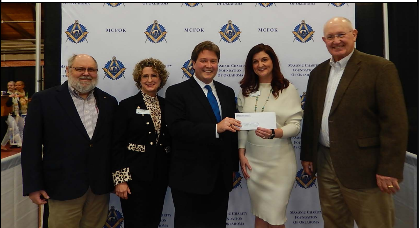
Check Presentation to Junior Achievement of Oklahoma

How do you feel the Masonic Charity Foundation can best serve the Masonic Fraternity of Oklahoma? By being a positive charitable organization and connecting with the community at large we can lead other good men to Masonry. The fraternity very much needs a positive public image and people need to know Masons are still engaged and productive members of the community. By making good choices and sharing our resources in meaningful way we will solidify our reputation with the public and help lead good young men to the fraternity.