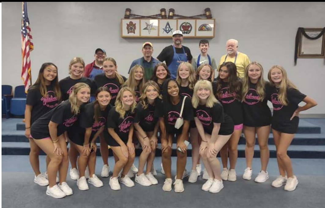
Fundraising breakfast with Westmoore Pom Squad at Myrtle Lodge #145