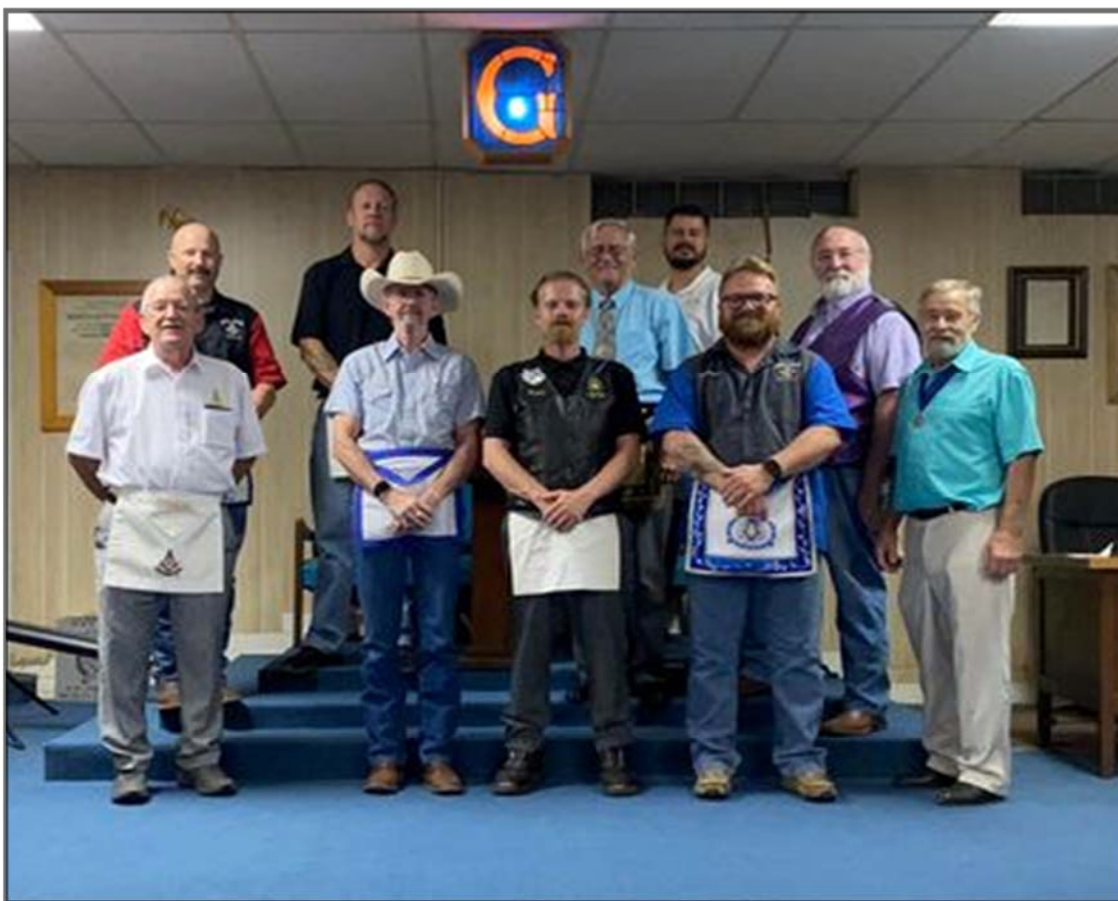
Bixby Lodge #359 raises a new Master Mason on July 28th

What goals would you like to attain as a Grand Lodge Officer? 1) Budget according to size of organization, 2) Adapt scope of fraternity, 3) Stop the decline in membership, 4) Develop effective succession planning at the Blue Lodge level.