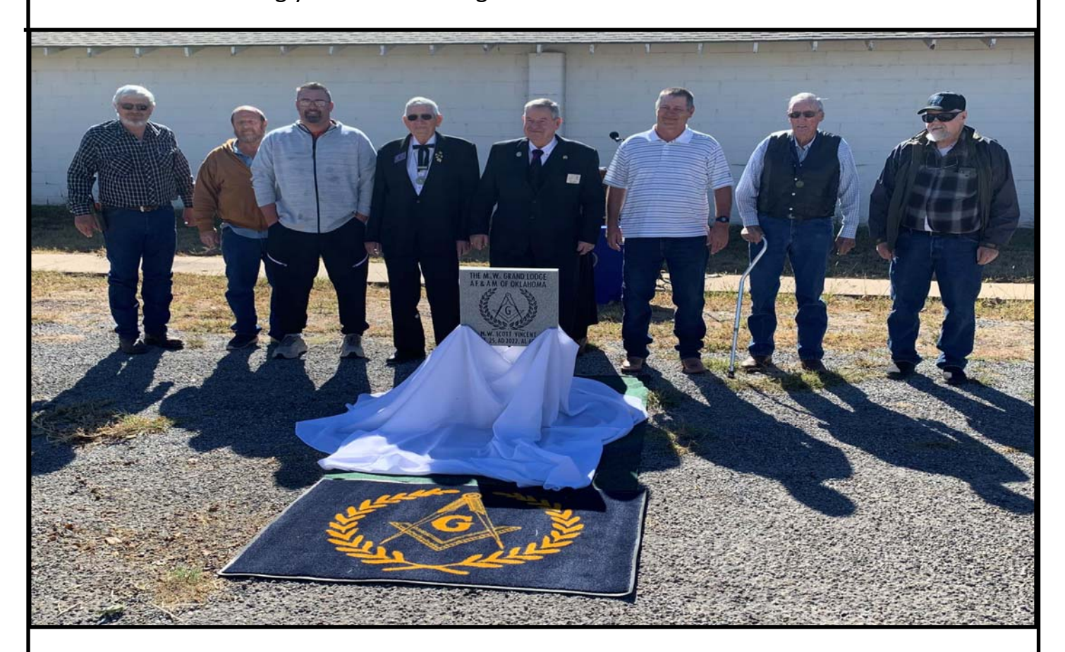
Seiling Lodge #495 Cornerstone Ceremony

I look forward to seeing you at Grand Lodge this November.