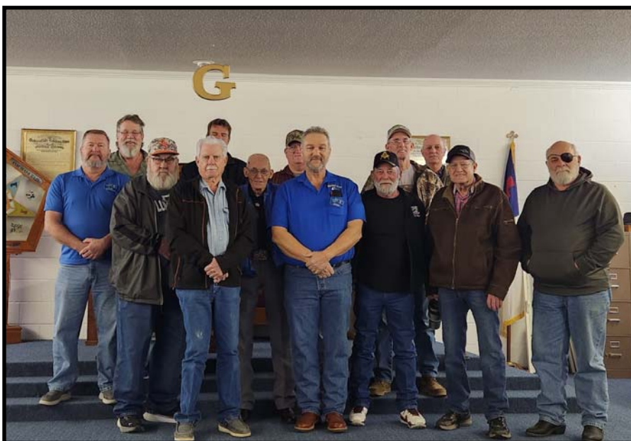
District 28 Meeting

TOGETHER, as Brothers, On the Level, WE CAN improve. WE CAN do better.