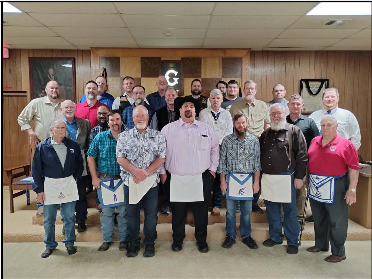
Comanche Lodge #41—Fellowcraft Degree—February 22nd